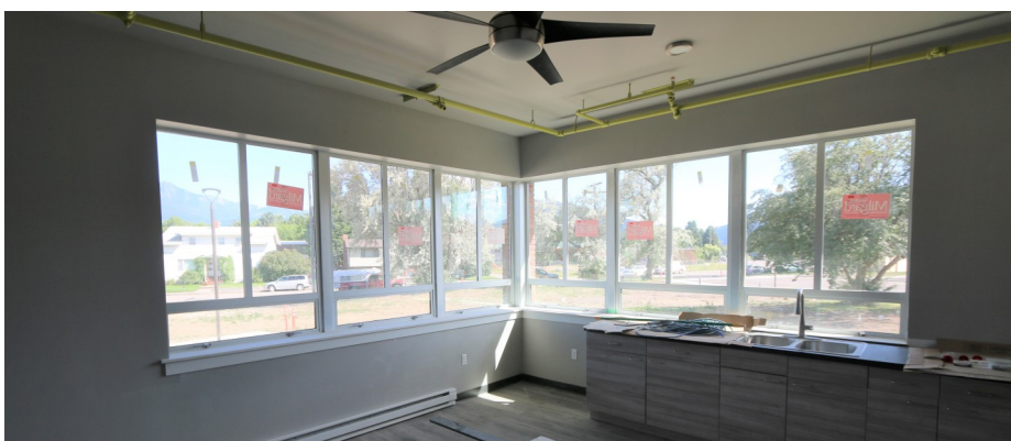
Bluebunch Flats - Unique, Special...Home